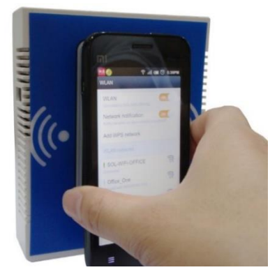
Smart WiFi with Tapping-forwifi feature (optional)