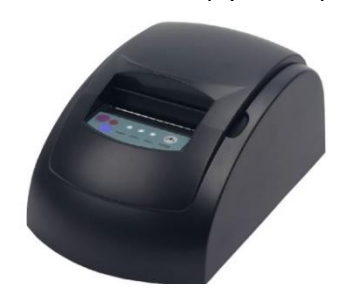
Thermal Voucher Printer (optional)

Dear customer Your Voucher code is: 93203311 Your internet duration is: 60 minutes. Please choose: WimaxWiFi on your smartphone or pc, open an Internet link and top up your internet usage with this voucher code to enjoy your Internet.